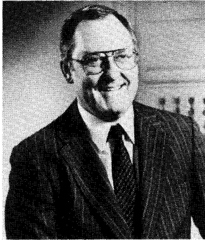
Gov. James Thompson signed the Vision Examination Bill into law September 11, 1987.

The law, which is part of the School Code Law, adopted on March 18, 1961, emphasizes that physicians licensed to practice medicine in all its branches, or licensed optometrists, shall perform all vision exams which may be required by school authorities.